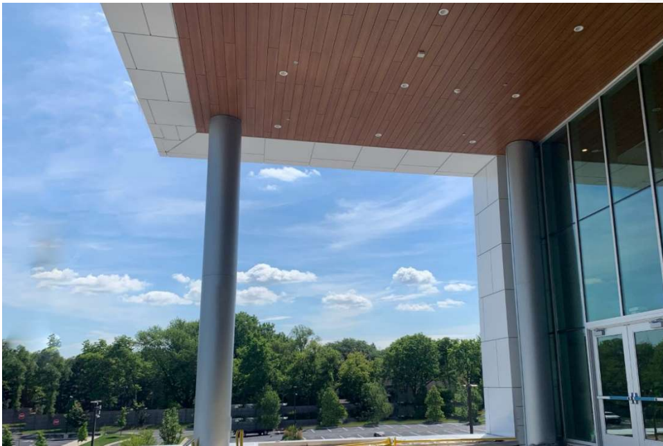
Exterior patio outside the Patriot Wellness Center.