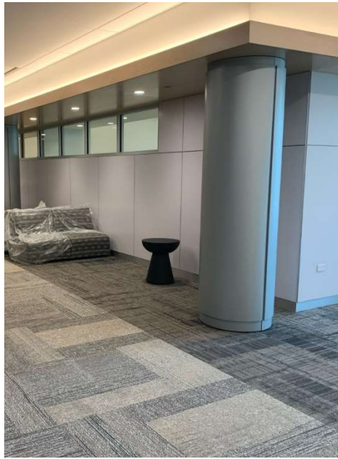
Gathering spaces for student wellness.